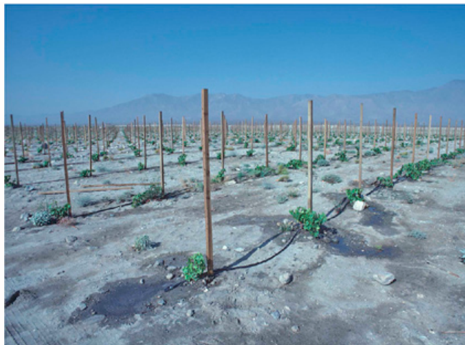
Figure 3. Example of a soil with poor structure and surface crusting. Note how the surface crusting causes irregular wetting patterns and the development of sheet and rill erosion. The impact of wheel traffic is visible at the lower left corner.

(O’Geen and Schwankl, 2006). In addition, stable aggregates resist particle detachment, prevent the formation of crusts, and are less susceptible to compaction. The significance of well-aggregated soil is further summarized in Table 1 .