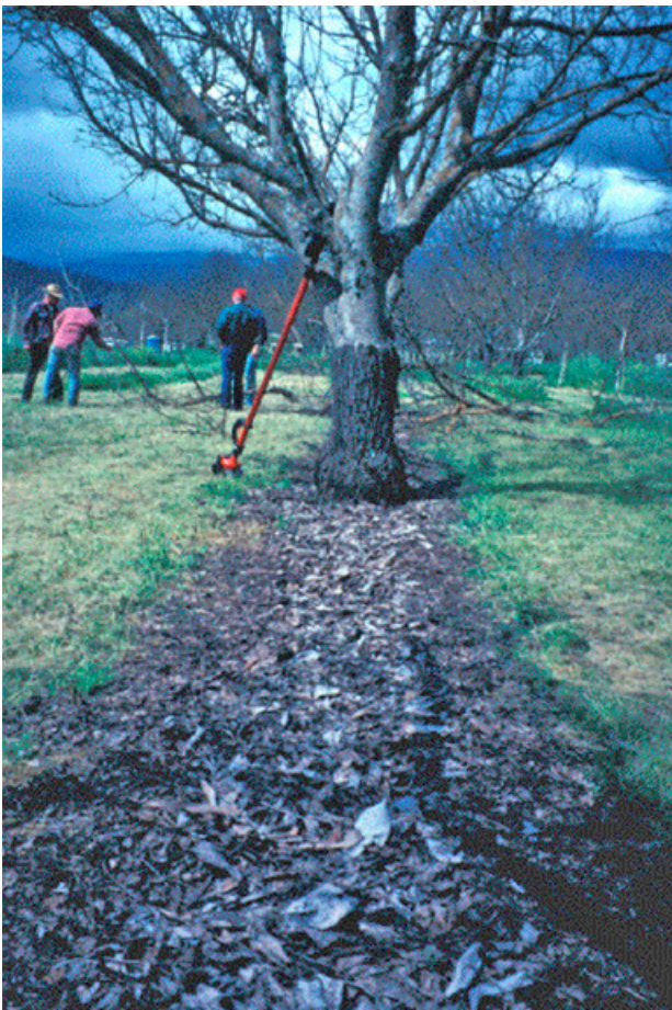
Figure 4. Walnut leaf mulch in walnut orchard rows, Lake County.

Mulch can consist of organic or inorganic materials. Examples of inorganic mulches are gravel, pumice, stone, and sand. Organic mulches usually are undecomposed materials such as rice hulls, wood chips, leaves, sawdust, and straw. Mulch protects the soil against raindrop impact and compaction, both of which destroy soil aggregates. An added benefit of mulch is that it reduces water loss to evaporation and so extends the period of time between irrigation events. In addition, mulching is an effective weed suppressant practice and can reduce herbicide usage (Figure 4). Mulch is best suited for sprinkler- or drip-irrigated