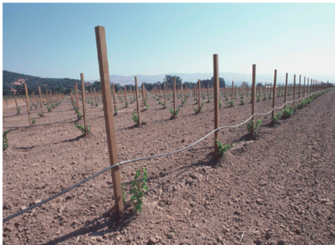
Figure 2. Example of a well-aggregated soil as indicated by the various sizes of surface aggregates.