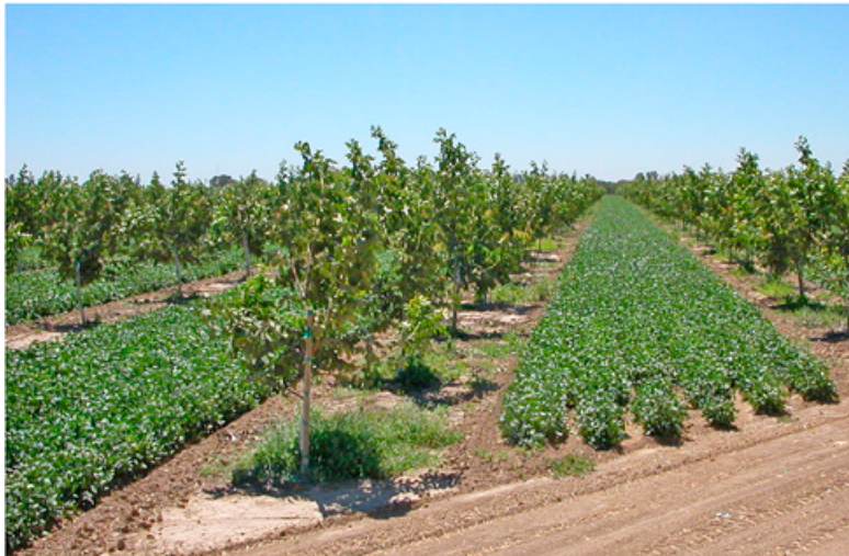
Figure 5. A legume cover crop in California's Central Valley.

According to the US Environmental Protection Agency, agricultural grades of PAM must contain less than 0.05% of the acrylamide monomer. In addition, PAM rapidly degrades when exposed to sunlight and through decomposition from soil microorganisms (Cahn et al., 2004).